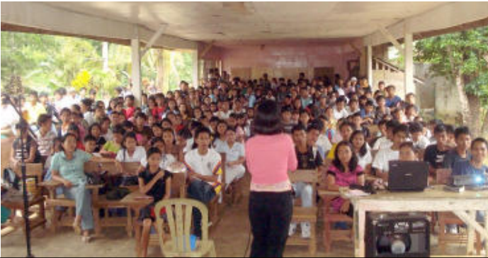
Sharing the Gospel to students of Anoling National High School in Caraga Regional Unit

IVCF Philippines became very active in communicating the gospel of the Lord Jesus Christ during the school year 2009-2010. During the 1 st Quarter, Freshmen Treat programs happened in different campus chapters of our regions. Different regions used different methods of sharing the gospel: Classroom Evangelism, Commando Evangelism, Creative Mime & Drama, and Evangelistic Concerts. In WVRU, we started Senior Retreat, sharing the gospel to graduating students.