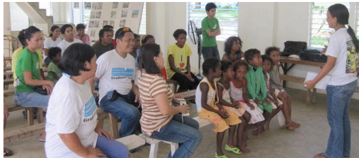
Missions to Mamanuwa Tribe In Southern Leyte, Central & Eastern Visayas

Our mission program focused on mobilizing students and graduates for missions in the campus with a long-term impact in the future. This involved re-educating our students about what missions is all about using our mission training program materials and special missions events.